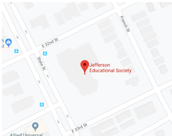
Jefferson Education Society, located at 3207 State Street.